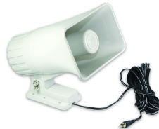
Additional PA Horn Speaker