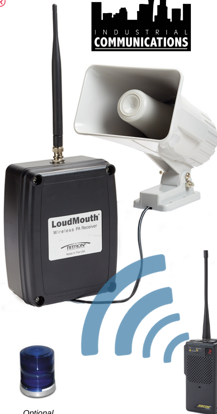
Optional Strobe Light